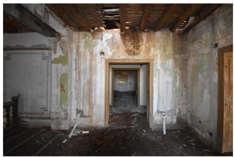
After the intervention March 2021