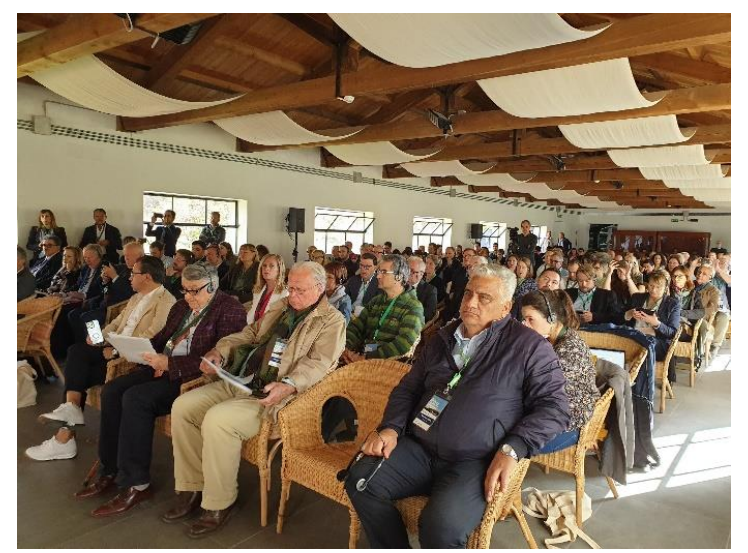
<u>Sila Declaration | Smart mountains: Making our territories more attractive and resilient in the face of social,</u> <u>economic and environmental transitions - Euromontana</u>

Euromontana and its members are committed to bring the vision of the Sila Declaration to European, national, regional and local policy makers in order to increase mountain communities' quality of life and to take the mountains on board of the current and future transitions.