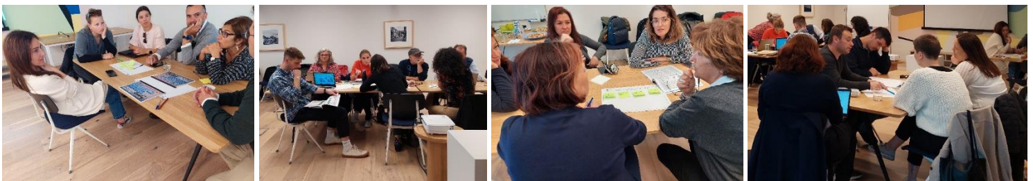
Figure 1. Work Groups during the Stakeholders Workshop

Each group encompassed, at least, one project partner member.