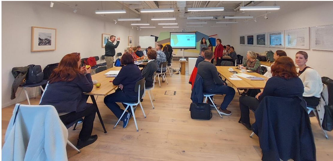
Figure 2. Stakeholders Workshop

Before the activities started, the Lead Partner made a short presentation on the goals and functioning of the session.