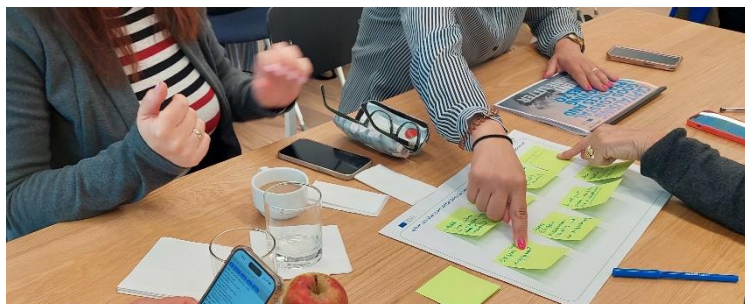
Figure 3. Post-its Activity