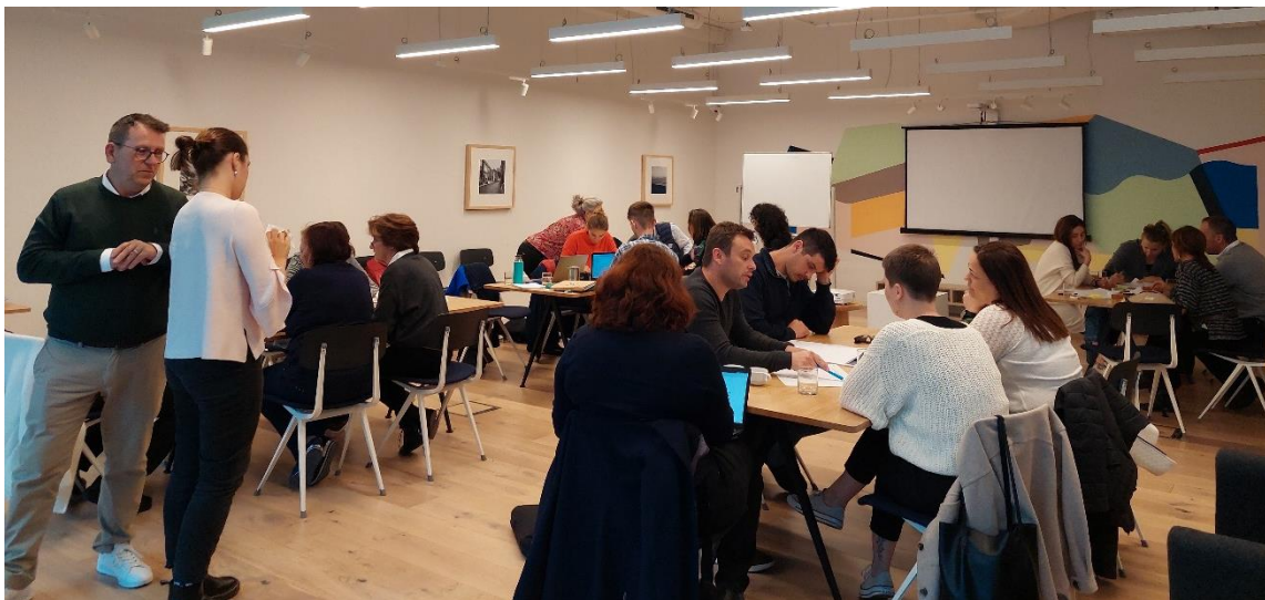
Figure 5. Stakeholders Workshop

Duration: 15 minutes (exercise) + 10 minutes (presentation)