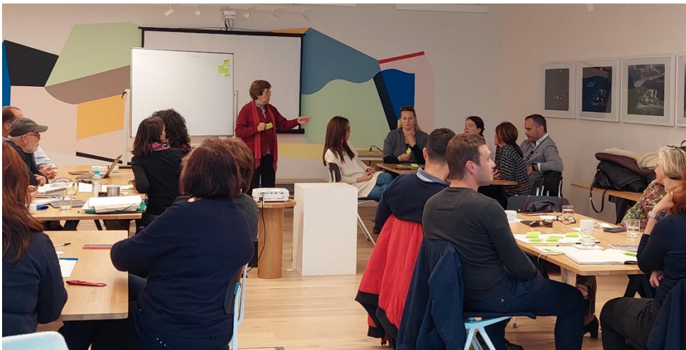
Figure 4. Collection of Post-its for Cloud Structuring